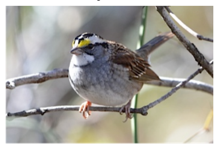
White Throated Sparrow: You might see him on the CBC.

If you would like to participate in the counting, please let me know. You don't have to be an insane birder (it is helpful but not necessary) to assist with the Count. In general, our Count circle is centered on Big Spring and forms a circle with a 7.5-mile radius. All counting is done inside the circle.