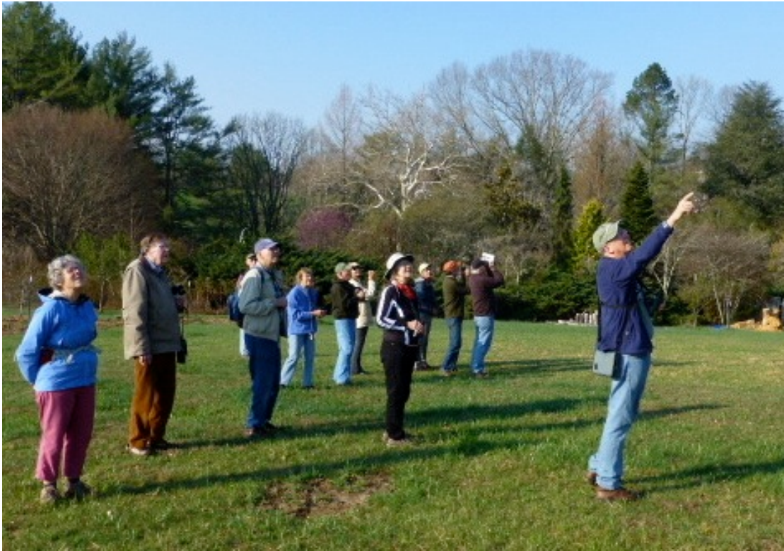
Figure 2. – Birding by Ear at Boxerwood Gardens