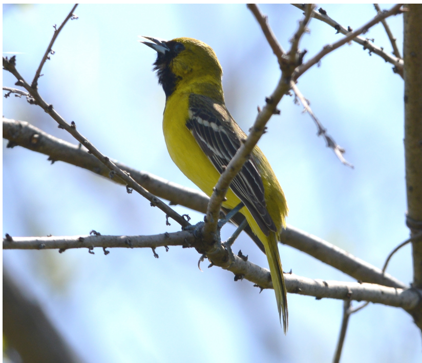
Figure 1-Orchard Oriole. Dick Rowe, April 27th